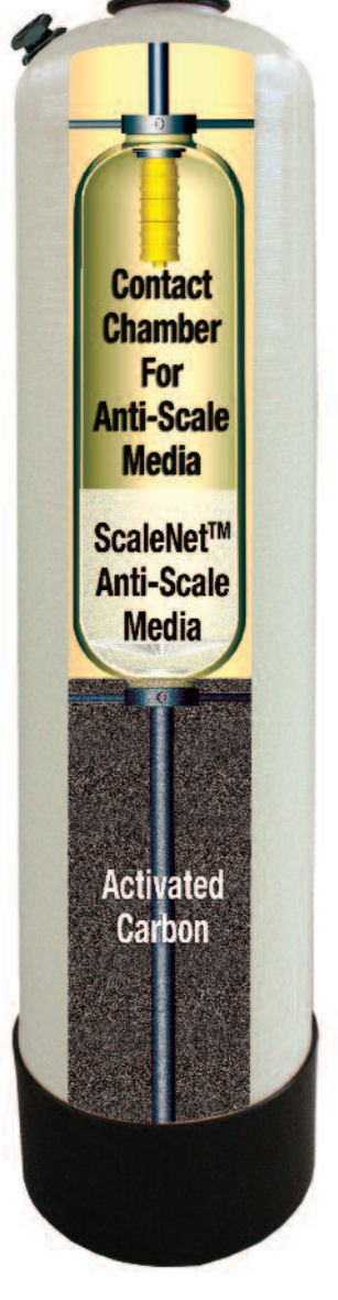
Model # ETREATWCS

* Performance testing proves ScaleNet™ anti-scale media virtually eliminates new scale formation and aids in the removal of existing scale. Results may vary, however, and performance is based on water hardness levels, flow rate and other factors.