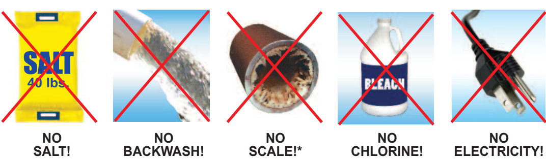
With E-Treat™ water conditioning systems, there's no salt, no backwash. no scale, no chlorine and no electricity! Here's how it works: