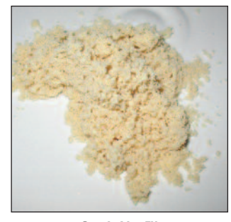
ScaleNet™ Anti-Scale Media

On the other hand, Calcium is important to human health, and supplements are recommended if Calcium is reduced or totally void in one's diet.